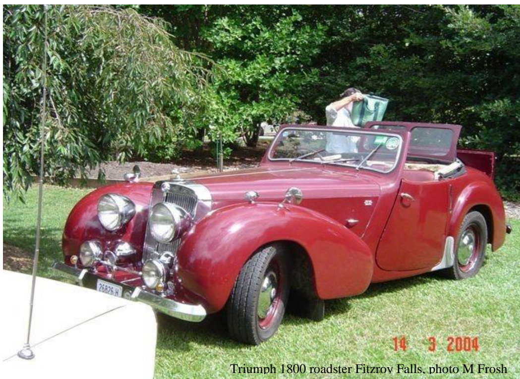
Triumph 1800 roadster Fitzroy Falls

Official Journal of Triumph Sports Owners Assoc (Ecurie Triumph) NSW Branch Inc.