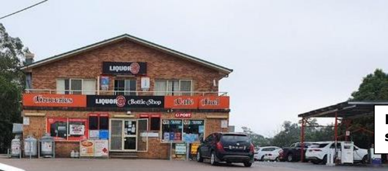
Kulnara general store