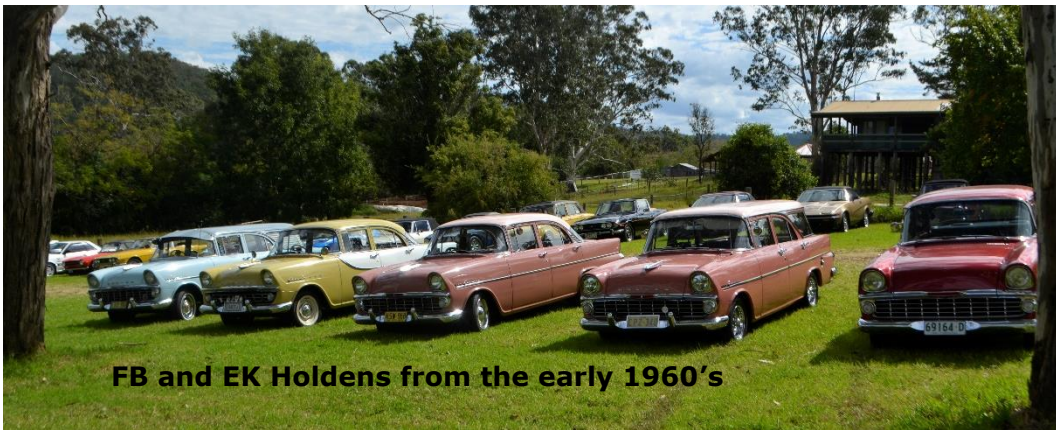
FB and EK Holdens from the early 1960's