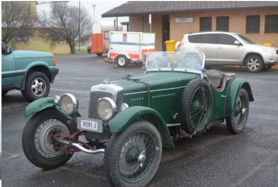
An early FrazerNash seen in the carpark.