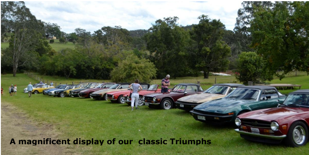
A magnificent display of our classic Triumphs