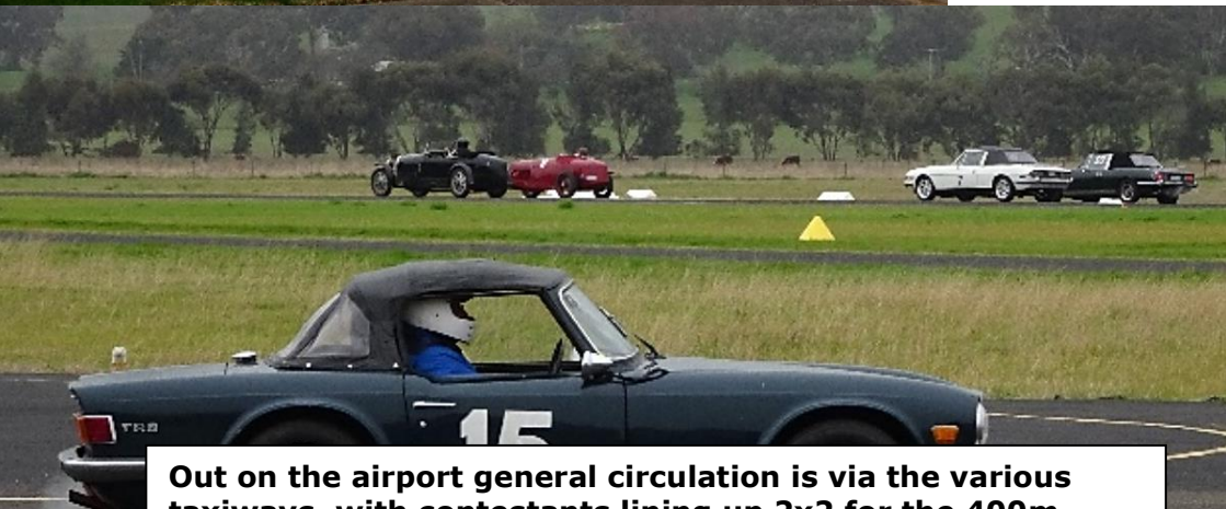
Out on the airport general circulation is via the various taxiways, with contestants lining up 2x2 for the 400m sprint down the actual airstrip (in the distance above). Note the drag racing type of 'starting lights' (below).