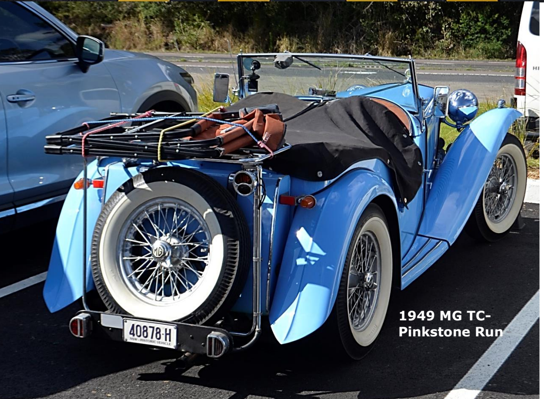
1949 MG TC- Pinkstone Run