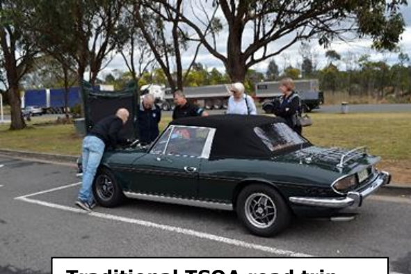
Traditional TSOA road trip behaviour the 'sharing' of the day's experiences'