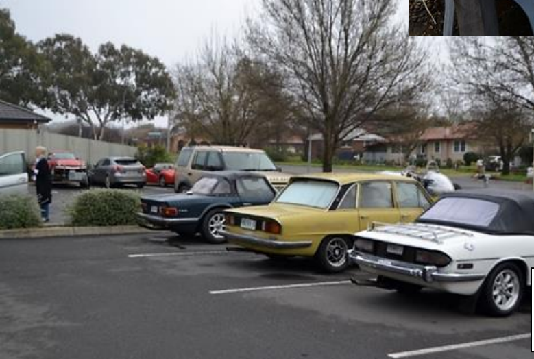
Motel carpark Cootamundra