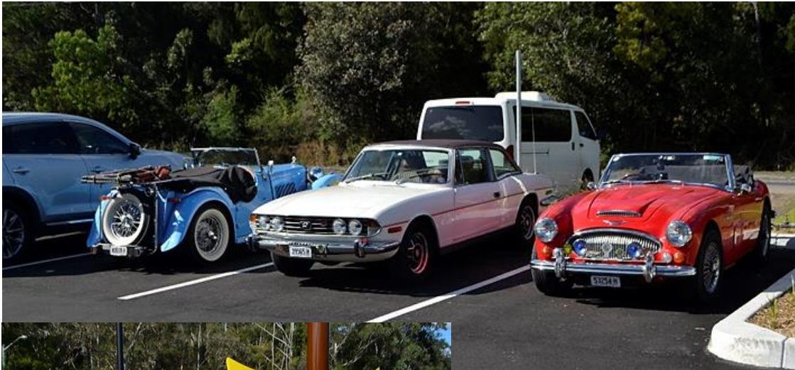
Sonia Goodwin's Stag