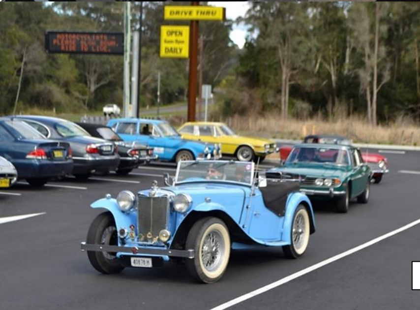
1949 MG TC